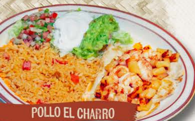
POLLO EL CHARRO

Chicken or Beef. Served with rice & Beans. 10 25