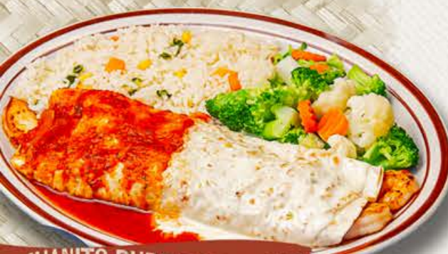
JUANITO BURRITO DEL MAR