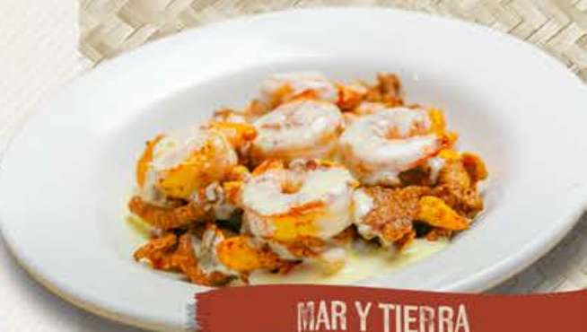
MAR Y TIERRA