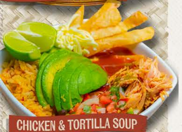
CHICKEN & TORTILLA SOUP