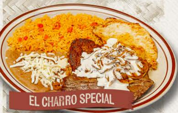
EL CHARRO SPECIAL