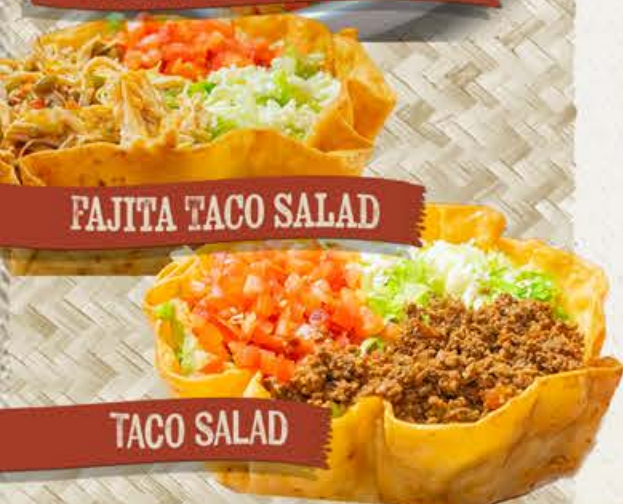
FAJITA TACO SALAD