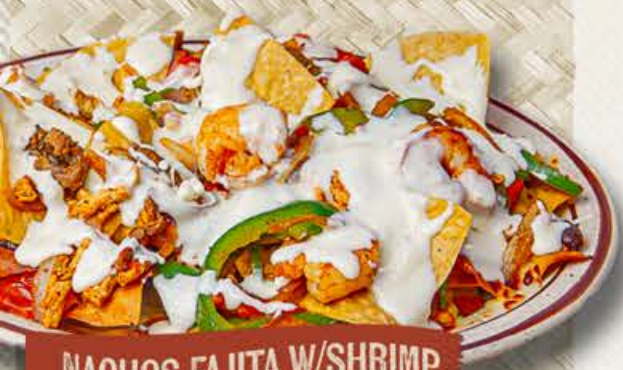
NACHOS FAJITA W/SHRIMP