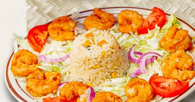
EL CHARRO SHRIMPS