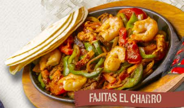
FAJITAS EL CHARRO

Pork tips served with beans, rice lettuce, pico de gallo, jalapeño & tortillas. 13 45