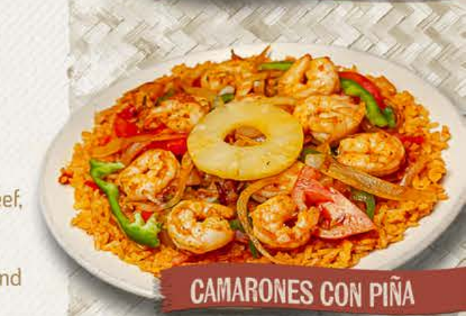
CAMARONES CON PIÑA