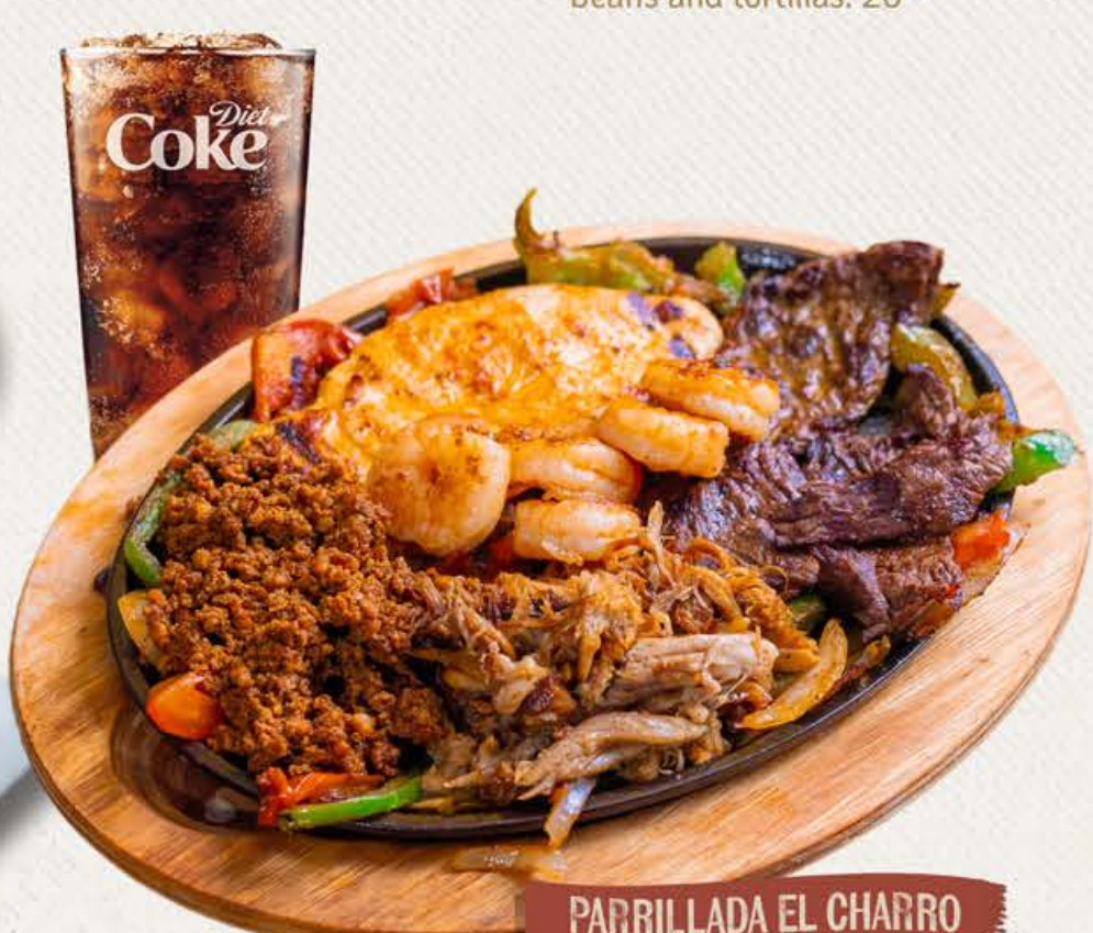
PARRILLADA EL CHARRO

Grilled Chicken, Steak or Al Pastor add 1 50