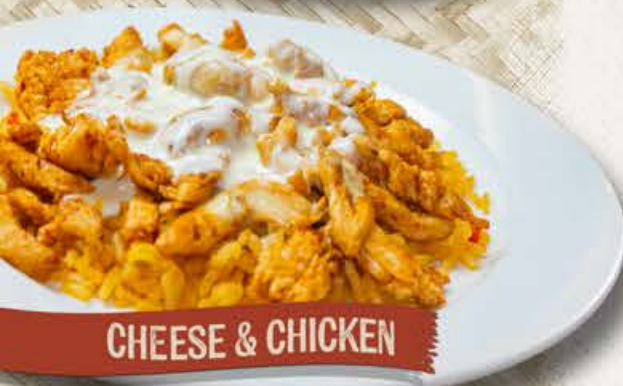
CHEESE & CHICKEN

Flour tortilla filled with grilled onions, tomatoes, bell Pepper, mushrooms and spinach. Topped with cheese sauce. 10 25