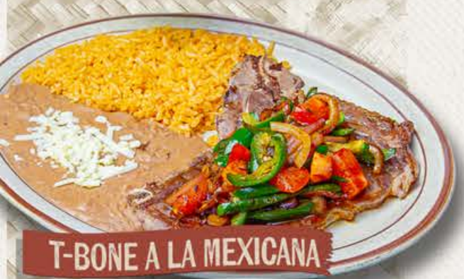
T-BONE A LA MEXICANA